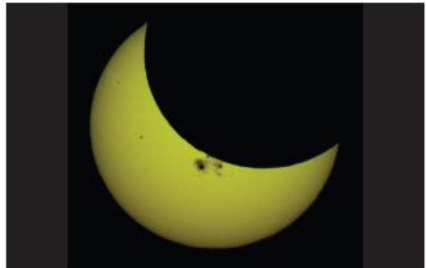
Most people in North America will see a partial eclipse.