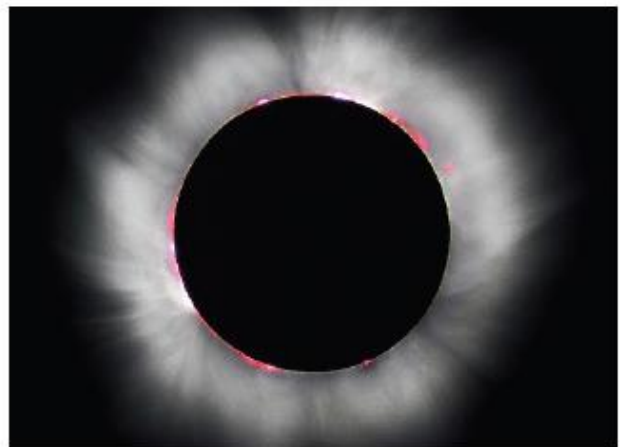
Only those people in the narrow path of totality will see the total eclipse.