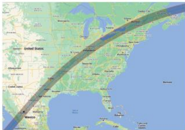
The path of the total eclipse.

If you are on the path, when only a sliver of sunlight remains visible, your surroundings will begin to darken, as if the Sun were setting in the middle of the day. Temperatures will drop and birds will go to roost, thinking that night is coming. Finally, the Sun will be totally covered and the beautiful solar atmosphere (the corona ) will become visible. Totality will last four minutes or less and then the Sun will slowly be uncovered.